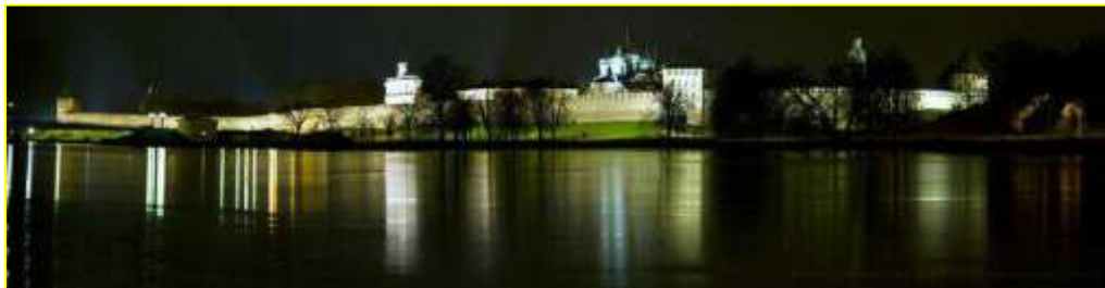
The Great Novgorod as it today.

(Translation : Ms. Deidre Betty Smallridge – Kokosi © 2014)