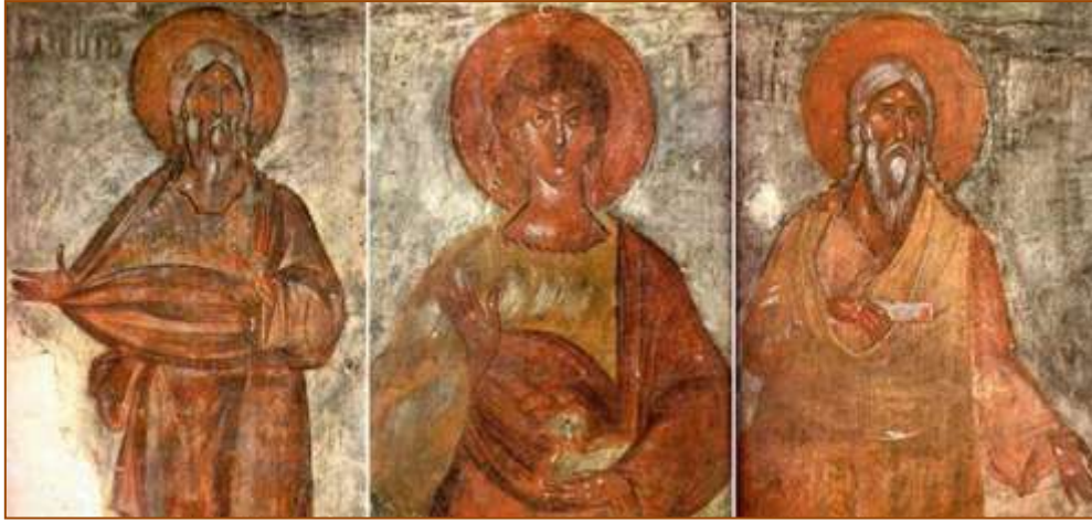
Theophanes the Greek "Forefathers Adam, Abel and Joseph", Novgorod 1378, Church of the Transfiguration.

Here are cited short quotes from the addresses of the Holy Patriarch of Moscow and All Russia Kirill and Archbishop of Athens and All Greece Ieronimos during the latter's visit to Moscow (23 - 30.05.2012). "We welcome you as a representative of glorious Greece, where on Areopagus Paul the Apostle preached to the pagans the true worship of the Unknown God (Acts 17, 23) and from where the Salonikan Saints, Brothers Kirill and Methodius, set out in order that the Slav peoples could receive the alphabet and writings followed by the Holy Scriptures along with the highest examples of thought from the Fathers of the Greek Orthodox Church. Their stamp was indelible; St. Fotios and other Greek Archbishops of Russia, founder of the School of Agiography. Theophanes the Greek, Brothers Lichoudi, founders of the Theological Academy of Moscow, Archbishop Ellassona Arsenios, Archbishop Eugene Vulgaris and Nikiforos Theotokis.....The Orthodox Church of Russia adopted and creatively re-examined the rich spiritual and cultural tradition of Byzantium". In response, the Archbishop of Athens commented, "... The historic Sacred Monastery of Danilovsky where we have just finished the doxology to the Trinitarian God and where lies the eminent Bishop Nikiforos Theotokis, who together with Saint Maxim the Greek, forged the brotherly bonds in Christ of our two, peoples..."