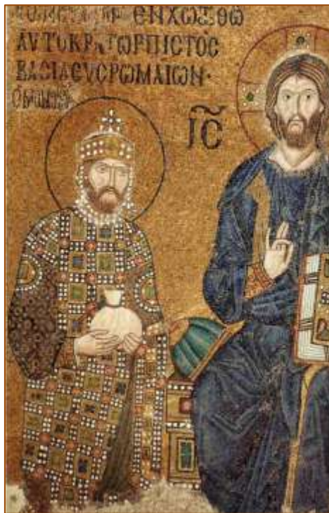
Mosaic of the Monastery of Vlachernes in Constantinople.

The history of Russian iconography began approximately 1000 years ago when Grand Prince Vladimir (952 - 1015 ad) led the Kievan Rus into the cultural orbit of Byzantium. The relations between Russian and Byzantium and later between Greece and Orthodox Russia have been close, brotherly and continuous up until the present day because they have been 'kneaded' with a common spiritual legacy.